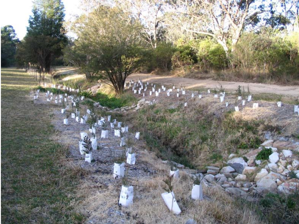
TAFE group plantings Central Park Wentworth Falls