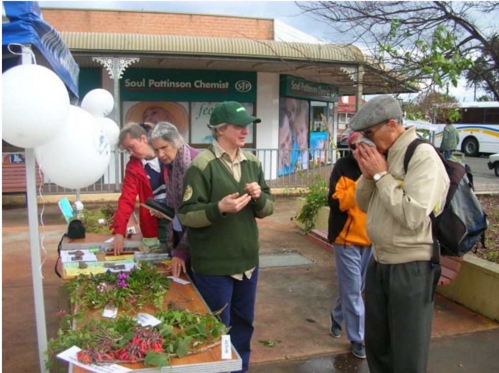
Weedbusters in Springwood

Four bushcare groups held tree planting events under the NTD banner as a promotional exercise - South Lawson, Marmion Creek, Cox's Reserve and Explorers Reserve Lapstone.