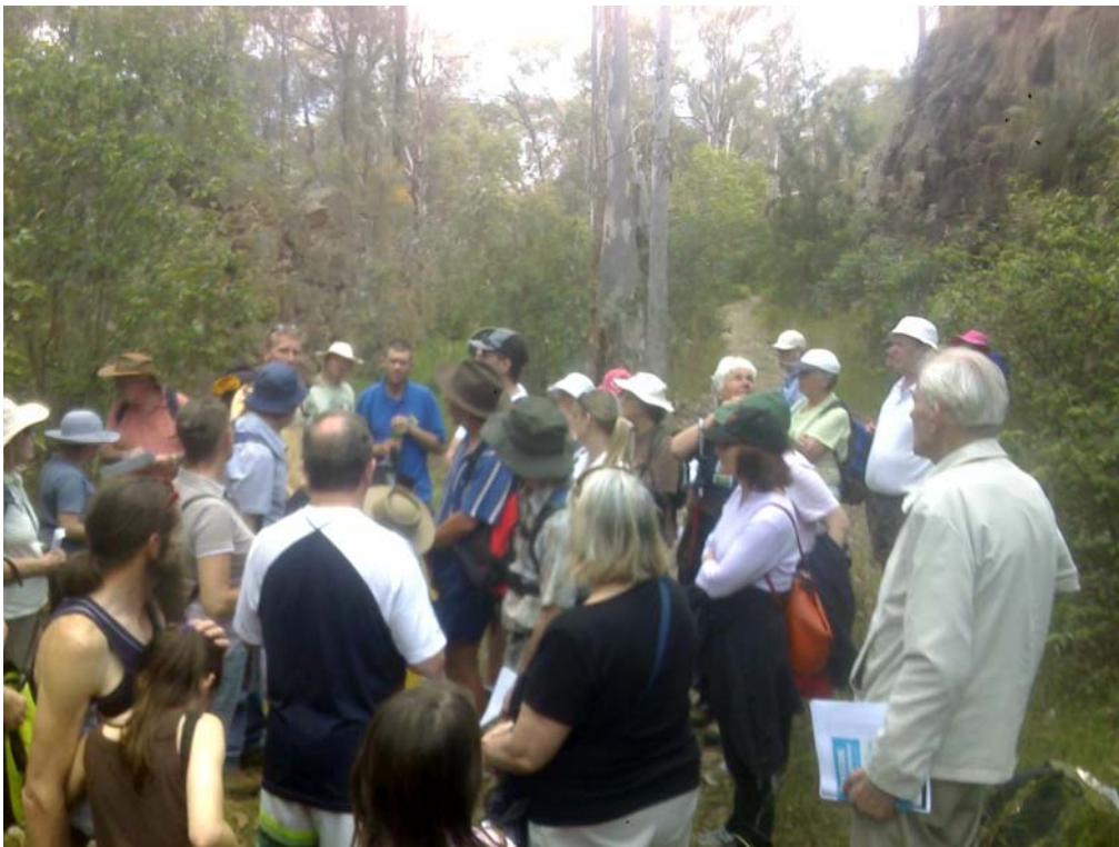
Knapsack Historic Walk

Stream processes workshop/ field day (November) Large Aquatic Life Presentation (October) Hazelbrook Microstrobos information and weeding days (see events section 3.28)