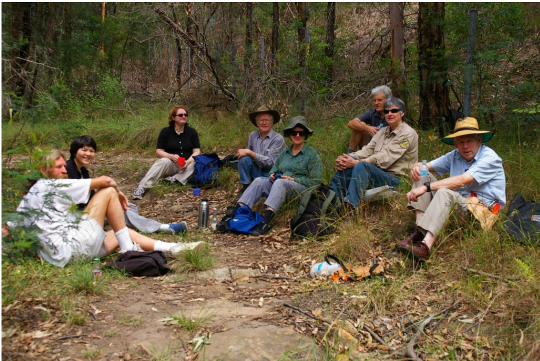
Photo 3 - Darks Common Landcare Group

Description: Bush Regeneration in SSTF forest near Springwood Golf Course.