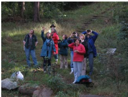
Photo 4- Deanei Biodiversity Workshop

The following Bushcare "Special Events" were held in the past 12 months: