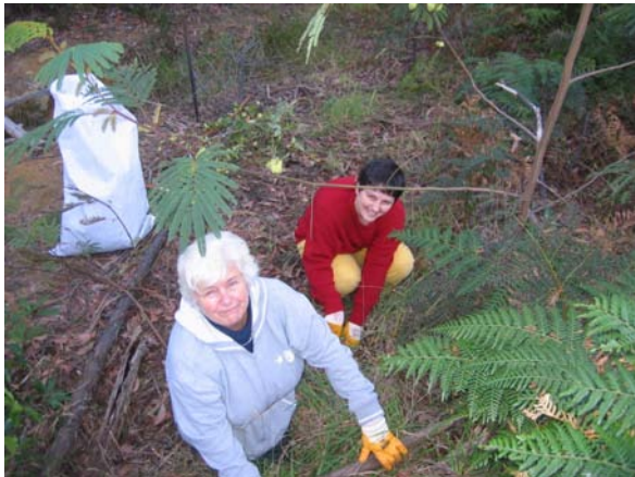
Photo 2 - New Volunteers at Gloria Park

Description: Bush Regeneration around Lawson Pool and in Wilson Park