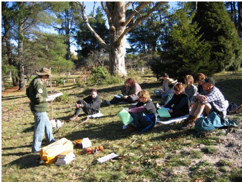
Photo 5 - Council Bushcare Officer Training a New Group at Medlow Bath