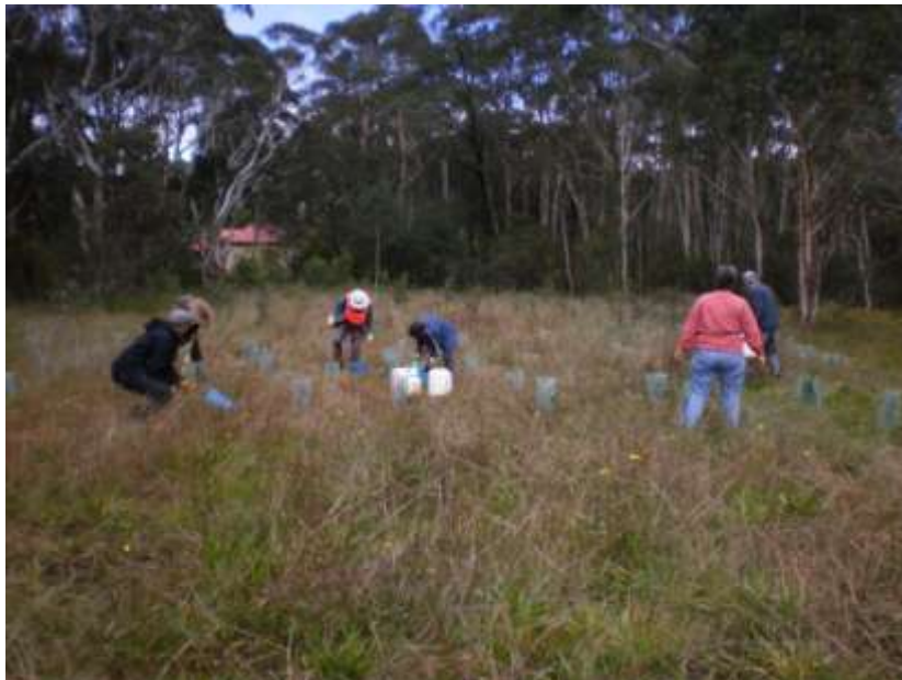
Marmion Swamp volunteers at the special planting event in April 2010

Participation in monthly bushcare groups is the main activity of the program, with 8471 volunteer hours involving 2505 site hours by Bushcare officers. During the year 9 special events were held on Bushcare days which gave an additional dimension to the normal group's activities.