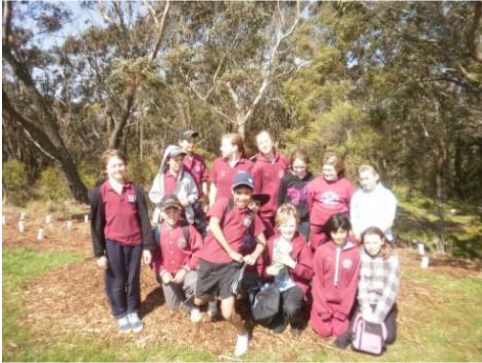
Katoomba Public School environment group

19 students from the environmental group at Katoomba Public School years 5-6 came to help Leura Cascades Bushcare group plant 200 tubestock to make an edge at Peter Carroll field. The group accompanied by two teachers learnt about bushland weeds and how to remove them correctly and made connections to impacts within the catchment.