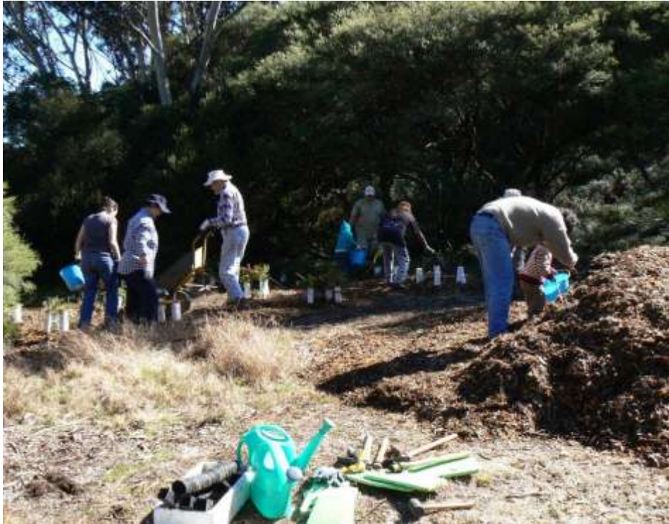
National Tree Day at Frogs Hollow Blackheath. 16 people planted shrubs, grasses and ferns, then enjoyed morning tea in the winter sun